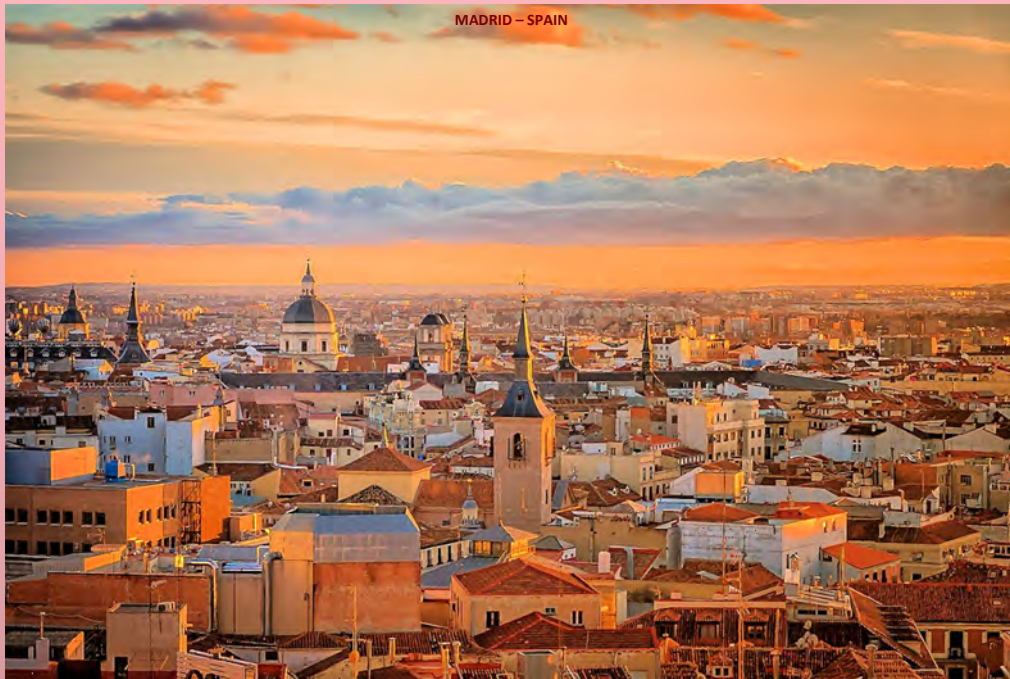
MADRID – SPAIN

This Mad Midlife romp through SPAIN & PORTUGAL will get us up-close-and-personal with the region's seductive culture ... its iconic landscapes ... its pulsating cities ... its bustling markets ... its avant-garde art ... its centuries-old architecture ... its to-die-for vino and gastronomy ... its medieval fortresses ... its towering cathedrals ... and its laid-back rhythm of daily life. Add to that a stunning selection of elegant hotels (with two-or-three-night stays wherever possible), lip-smacking gourmet food, and lots of laughs along the way ... you really couldn't choose a better tour!